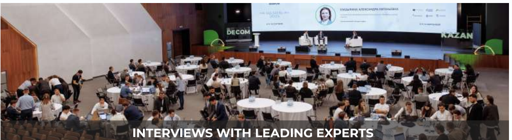
INTERVIEWS WITH LEADING EXPERTS