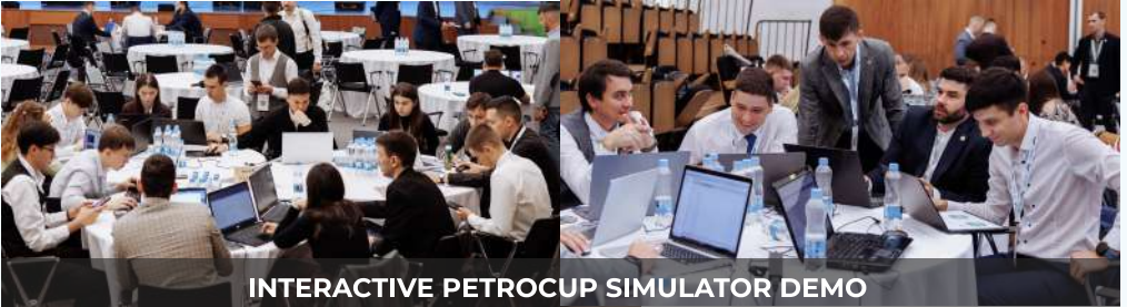
INTERACTIVE PETROCUP SIMULATOR DEMO

Competitions are held between teams of subsurface users, oilfield service companies, research and design centers and institutes, as well as specialized universities.